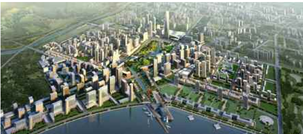
Image rendering by Crystal Beijing, courtesy of master plan architect Kohn Pedersen Fox Associates PC. (www.NewSongdoCity.com; www.kpf.com)

N ew Songdo City is being created as a hub for north-eastern Asian commerce. It is being conceived from the ground up as a "ubiquitous city" in which residents and business will enjoy fixed-line fibre optics to every home and business; high-speed wireless computing access everywhere; fully integrated home networks; and the melding of facilities, IT and property services under one operational and management structure. Residential building types derive from the Korean penchant for high-rise living. The strategies of urban design, on the other hand, have been deliberately derived from reinterpretations of European, American and Asian cities, adapting them for the Korean context. This $25 billion project – the largest private real estate development in history – is a joint venture between Gale International, a US-based investment and real estate development company, and Korea's POSCO E&C. ///